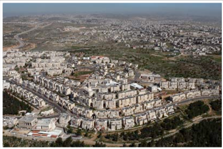
Sprawling Israeli settlement Ramat Shlomo in the West Bank